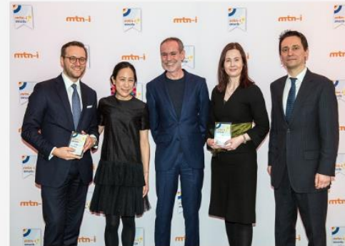
IFC wins 'Deal of the Year, EUR Green NSV Bond' at MTN-i Awards