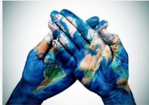
IFC publishes a new Social Bonds Case Study

A ONE-STOP REFERENCE FOR KEY IFC SUSTAINABILITY PUBLICATIONS, TOOLS, LEARNING PROGRAMS, AND MORE