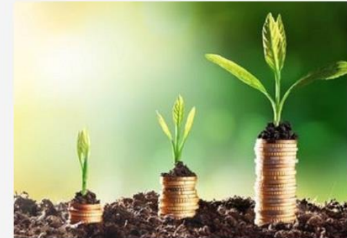
IFC Celebrates Double Win in the Environmental Finance Bond Awards 2020

I read lots of scientific and finance publications as well!